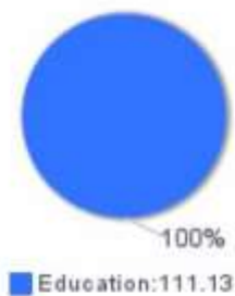
Table 1: MSYs by Focus Areas