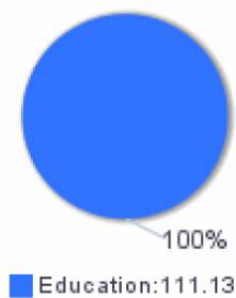
Table 1: MSYs by Focus Areas